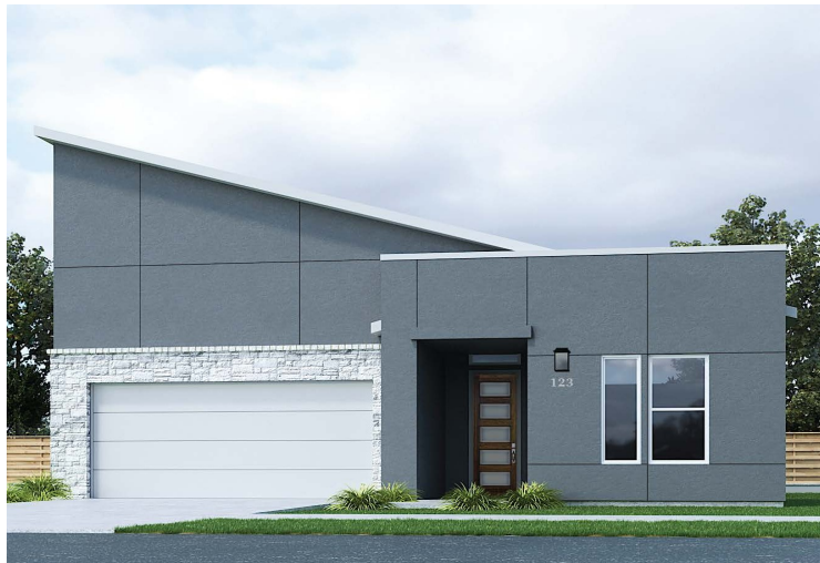
Elevation C, Color Scheme 2: 1460 SQ FT

Prices, floorplans, and features are subject to change anytime without notice. Front porches and window types change sizes and vary with elevation. All square footages are approximate and may vary upon elevations and/or options selected and may change without notice. Any material colors depicted including windows, doors and shutters are subject to change and may not represent actual color installed on home. Any landscaping is an artist's rendering and actual landscaping will differ. Home prices will differ based on lot premium and elevation material, and are subject to change without notice. Exterior stone is a natural material and is subject to variation. Please contact your Keystone New Home Counselor for current information. ©2025 | Keystone Homes & Properties, LLC. Effective 12/19/2025