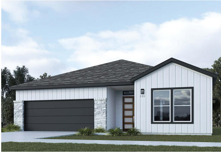
Elevation A, Color Scheme 5: 1460 SQ FT