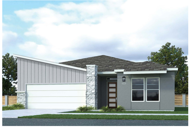
Elevation B, Color Scheme 1: 1460 SQ FT